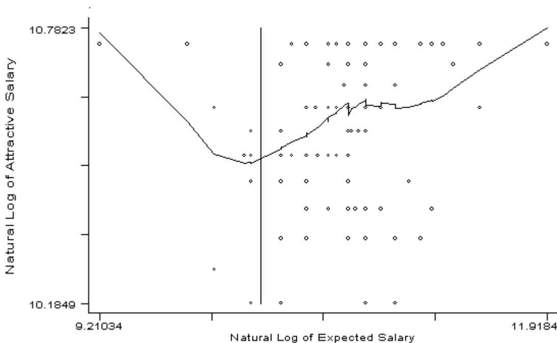
Figure 3. Relationship Between the Natural Logarithms of Expected Beginning Salary and the Teaching Beginning Salary Respondents Chose as Attractive – Junior Respondents

The figures show that expected pay level was not as strong a predictor of the attractive pay level as might be expected. The correlations between the natural log of the attractive and expected beginning salaries were .41 for the sophomores and .21 for the juniors. The figures show that at most levels of expected salary, there was a wide range of attractive teaching salaries. While in the middle range of both variables the relationship between has the expected upward slope (Note 2), there are two interesting anomalous groups of participants. In the upper left corners, one group of participants had low expected salaries but claimed to be attracted to teaching only by much higher teaching salaries (higher than their expected salaries). In the lower center, another group had relatively high expected salaries (compared to teaching) but chose the current average teacher minimum as the salary that would attract them to teaching.