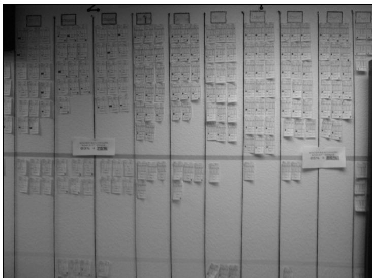
Figure 2. The data wall.

These data walls used distinctive characteristics of the material world to organize symbolic displays of quality (Goodwin, 1994). Figure 2 shows how these walls were divided into columns and rows. Each column represented a classroom, while each row represented the classification schemata of the DIBELS, i.e., intensive, strategic and at-benchmark. Each piece of paper on the wall represented a student and his/her DIBELS scores over time. Individual pieces of paper were moved up or down the rows of the data wall as DIBELS scores changed. The arrangement of these pieces of paper conveyed a judgment about each teacher's quality. A single rapid scan through the data wall informed viewers about those students were not meeting benchmarks and their corresponding teachers. Trina, the language coach, elaborated on data wall meetings: