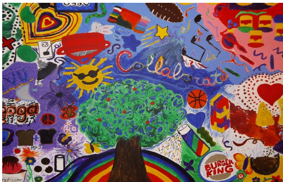
Figure 2. PSTs' thinking about education

Annually, the lead author coordinates a giant shared art piece with the exiting PSTs. Upon its completion, it is displayed in a hallway or classroom in our department as a reminder of that graduating class' thinking about education (Figure 2).